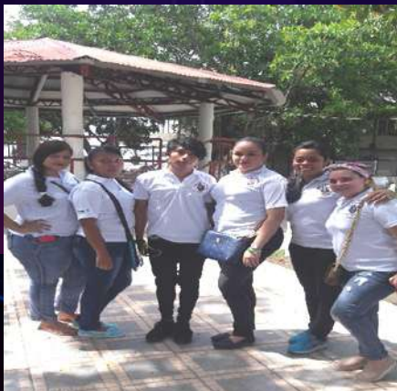
Anniversary of the English school 2017.

These activities are celebrated throughout the month of May and begin with a mass with all the students and professors of the school. Everybody is asked to bring non-perishable food, so that they are given to people of limited resources. Also for each class of the school students made a baby bath (it is a gift given to mothers in the hospital after giving birth; this gift contains baby things), and they are delivered in the hospital to the mothers who give birth the day we deliver the baby bath. While some students and professors are in the hospital delivering the baby bath, another group of students and teachers are on the radio making an address where they talk about the foundation of the English school, the number of students the school has and the achievements of the school in general.