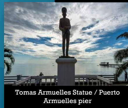
Tomas Armuelles Statue / Puerto Armuelles pier