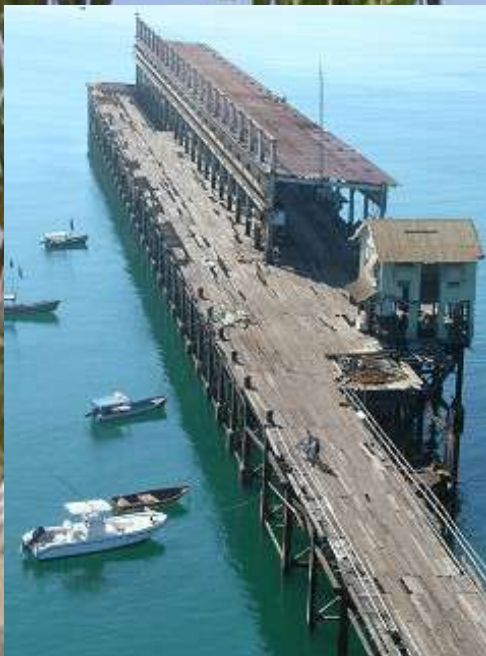
Fiscal dock of Puerto Armuelles

For years Puerto Armuelles has been cataloged by many Panamanians as a 'ghost town' and many associations seek to put an end to this bad reputation, so that many people know that the district of Baru has many good things to offer.