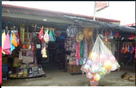
Peddlers sell a little of everything.