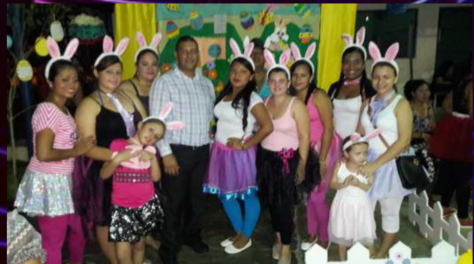
Get Together 2017: Easter

“Education is not the learning of facts, but the training of the mind to think.”