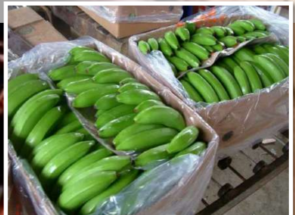
Packed banana (Green Gold)

In conclusion, the company had the vision that the production in Baru would be a success, and carried it out. Moreover, it provided its workers, the region and the city diverse sources of work, innumerable monetary contributions and buildings as a gesture of thanks for the great effort of the population in producing a quality banana. Unfortunately, the business was no longer profitable for the company and the government did not act in a timely manner leading to failed negotiations. In consequence, the history of the relationship between Baru and the CLC as an effective team, ended. Now, our people regret their decisions to protest against the company. It is a fact that we only value things when they are gone.