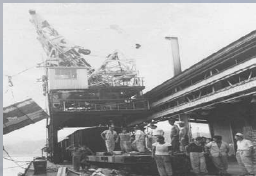
A port where were exported the bananas.