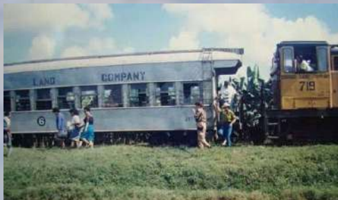
Railway - Chiriqui Land Company