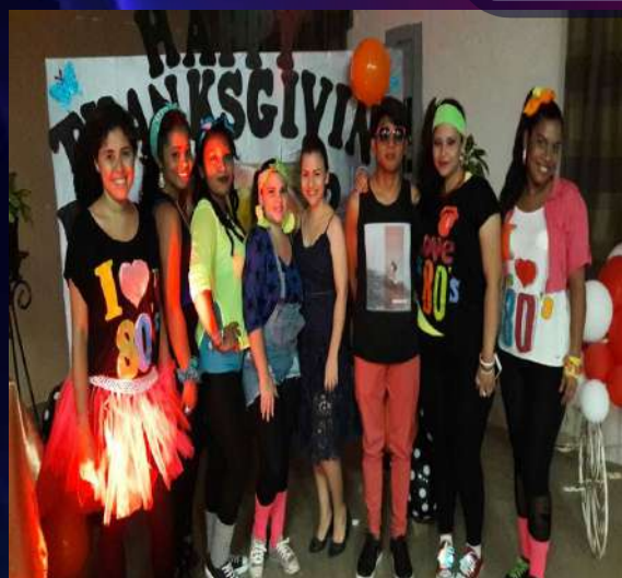
Thanksgiving 2017: 80's Choreography

To make these presentations students do reserch on internet about the traditions of this city. For example, each year the students of first level make the representation of pilgrims and other performances. It is putting in practice and taking part of this American culture. Also, and very important in this event is a dinner where everyone participates as a family.