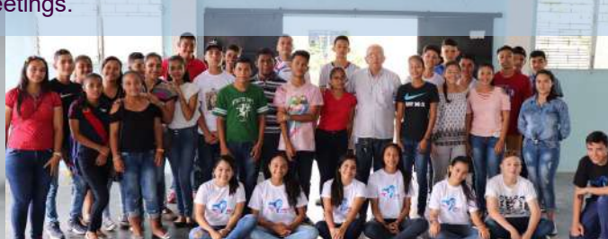
Group of barulence youth who is going to participate in the JMJ

Undoubtedly the educational centers, the community, the institutions and the whole community will find in the day many reasons to develop activities of all kinds in the pre-day meetings.