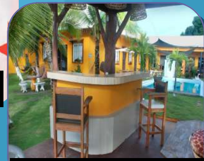
Big Daddy's Hotel, Pto Armuelles