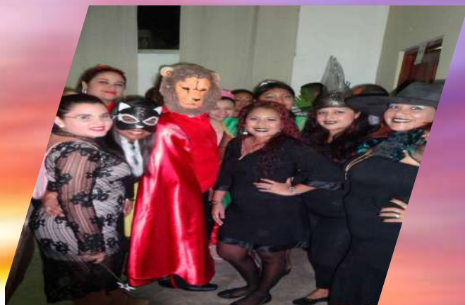
Drama: Shrek on Thanksgiving Day

T hanksgiving day is a celebration to give thanks to God. The students of C.R.U.B.A. following the traditions and culture of the United States, the English school celebrates thanksgiving day putting the English language as a second language. They make representations as in the United States. This celebration is the last Thursday of November.