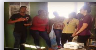
Teaching strategy: Telephone