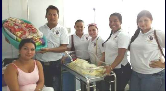
Second-year night students to hand out the baby bath.

The Anniversary of the English school is one of the main activities of the English school where it is celebrated one more year of being founded. The English school was founded in 1995. It currently has three shifts: morning, afternoon and evening. The whole program takes four years to complete if it is in the morning and the afternoon shift, in the night shift it is five years because there are fewer hours of classes.