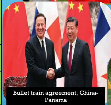
Bullet train agreement, China-Panama