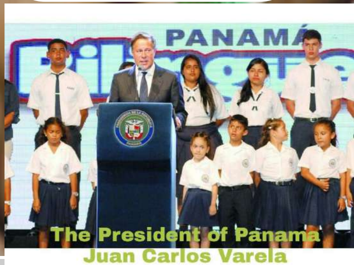
The President of Panama Juan Carlos Varela