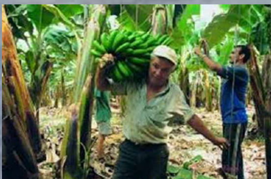
These people were called "Conchadores", who received the banana to take it to the cable.