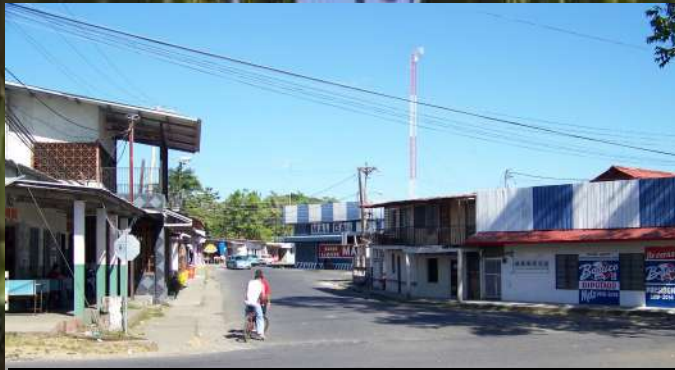
City of Puerto Armuelles