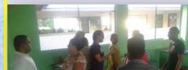
Teaching strategy: Inside and outside circle