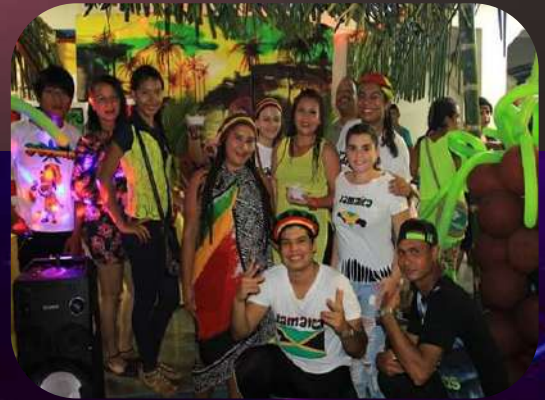
Get Together 2016: Jamaica

In short, this party or competition is an activity that allows students to experience various emotions, test their skills, and develop the necessary abilities for their proper performance in the competitive world of work. Despite all the unpleasantness and hardships suffered on the way to Get Together, the day of the event is a magical moment. All of the fights, the disagreements, the economic expense, the irresponsibility of classmates and so on, are forgotten. Stress turns into excitement, nerves into satisfaction, and everything else in that moment becomes joy. A sense of companionship seizes us, because we are a united school; we are a great family.