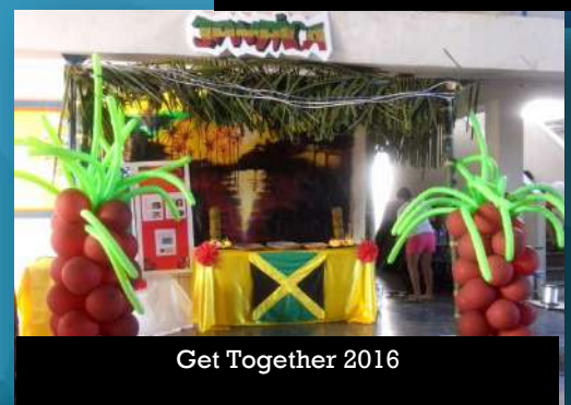
Get Together 2016